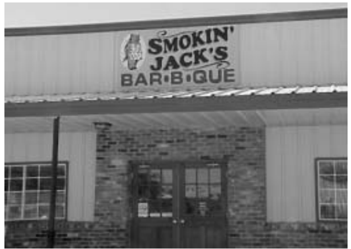
Smokin' Jack's opened in Demopolis in January. The barbecue restaurant used AERN to help develop its business